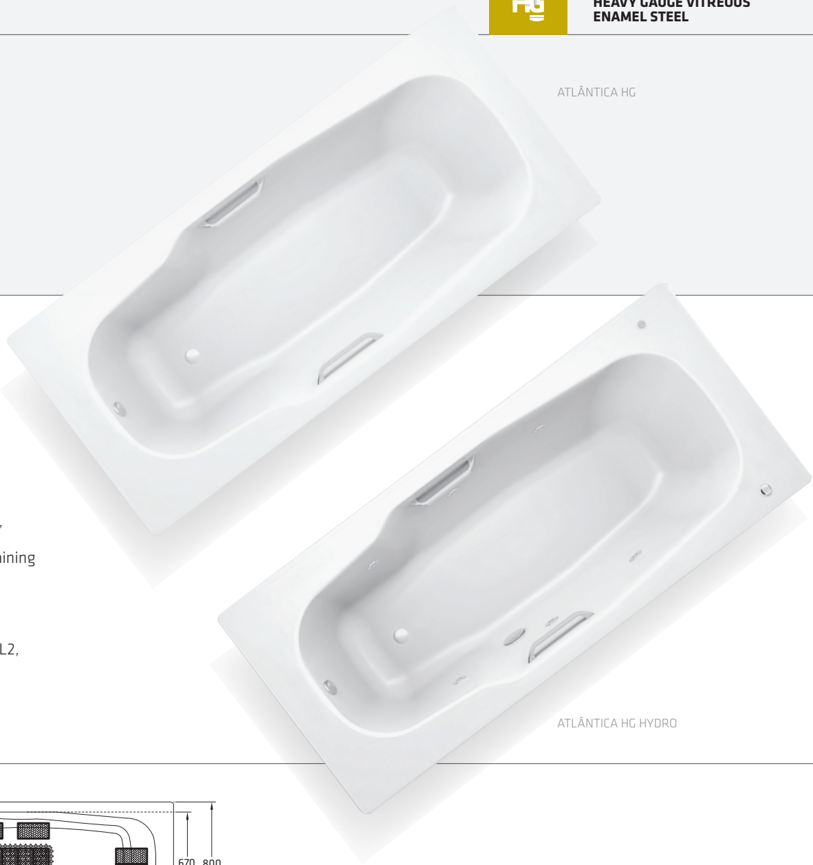
ATLÂNTICA HG HYDRO

CE mark according to EN 14516-CL1+CL2, Certified with Environdec.com, Environmental Product Declaration according to ISO 14025.